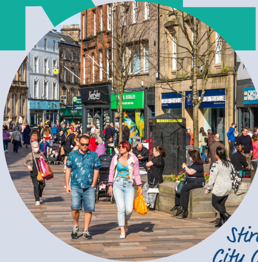
Stirling City Centre