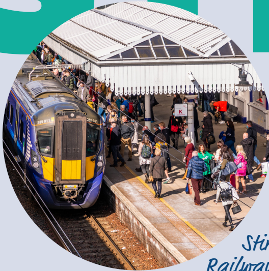
Stirling Railway Station