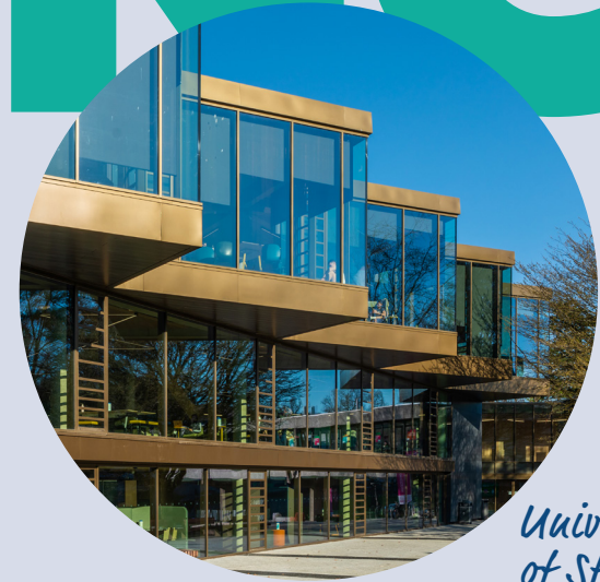
University of Stirling